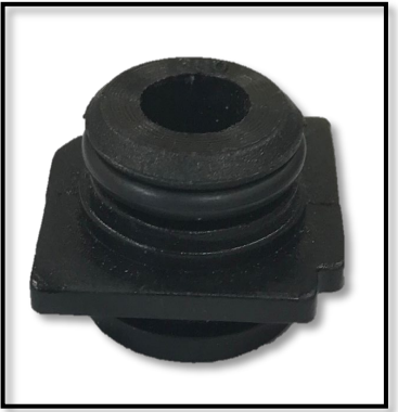
Figure 3 Sealing plug installed from factory